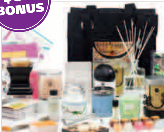
FULL BUSINESS BUILDER KIT*

START AS A FRAGRANCE CONSULTANT TODAY FOR ONLY $20!